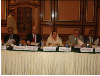
An in-session view of the 5th AGM of ASF, October 28, 2010, Lahore.